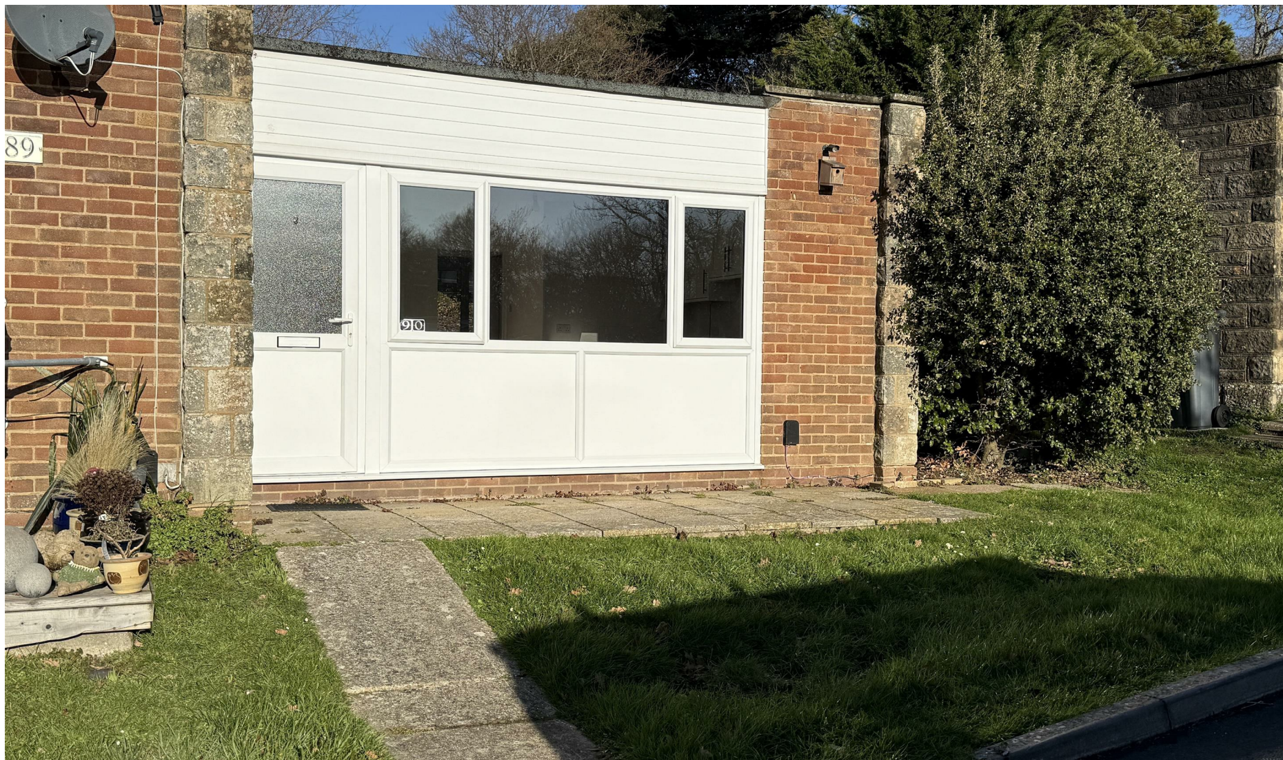
90 Gurnard Pines, Gurnard £79,000